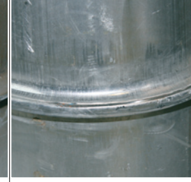
Dinex: Special pressing tools to close the silencer