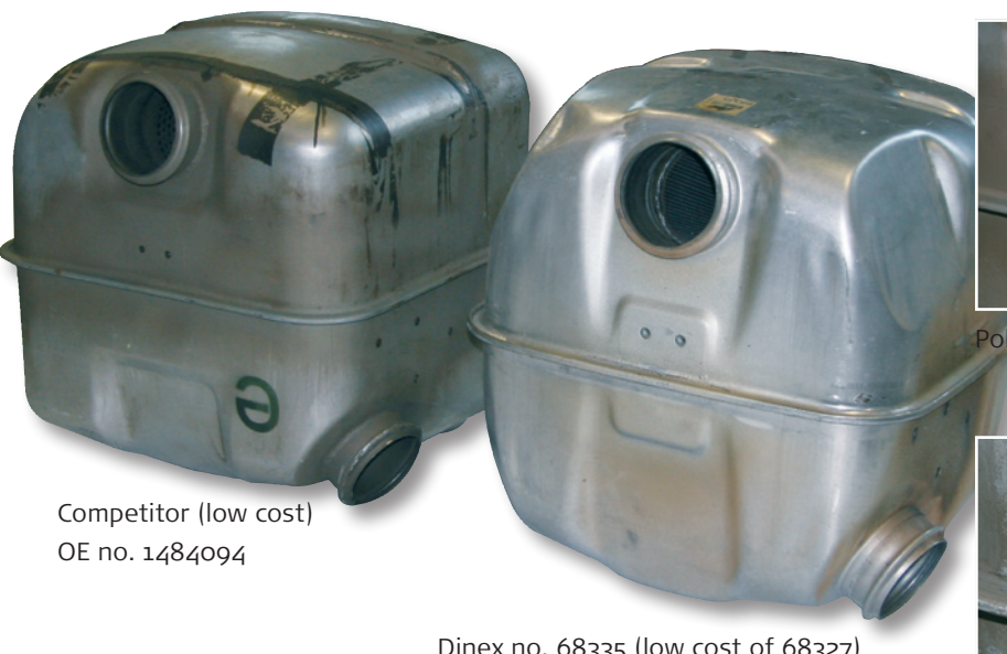
Dinex no. 68335 (low cost of 68327) OE no. 1484094